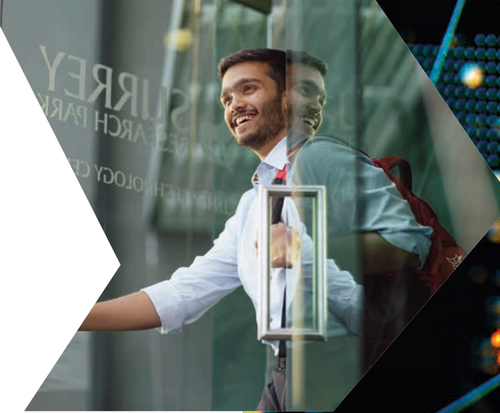
A student entering the Surrey Research Park

It was shortlisted for the University of the Year in the Sunday Times Good University of the Year 2023.