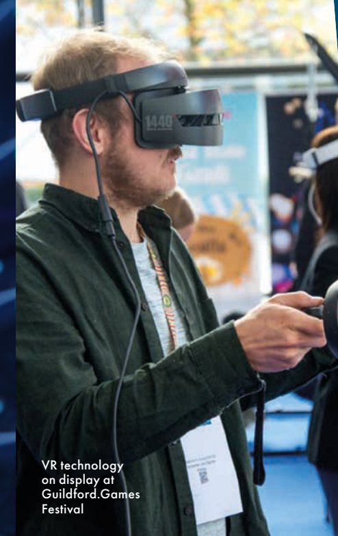
VR technology on display at Guildford Games Festival