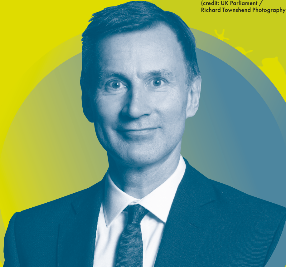
Rt Hon Jeremy Hunt