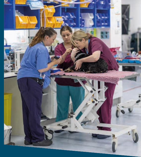
Veterinary students at Surrey Research Park

The anchor is the UK Government's Animal and Plant Health Agency which – following a £1.4 billion investment from the UK Government – is equipped with state-of-the-art laboratories and research facilities, enabling it to conduct advanced diagnostic testing and pioneering research.